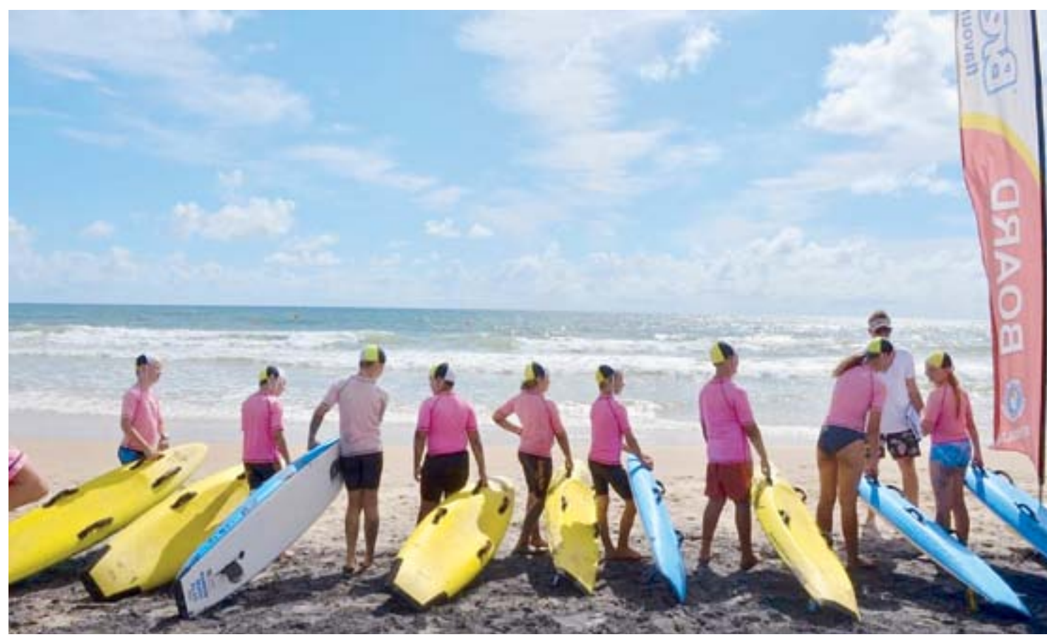
Under 11s before their board race.