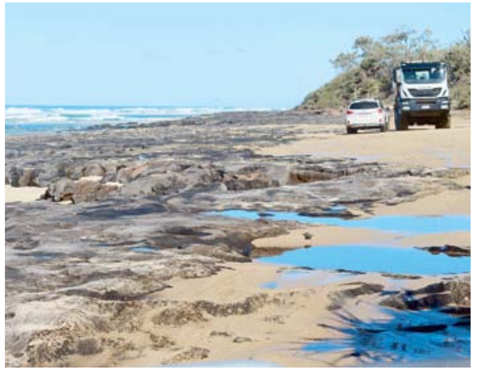
Ratepayers are invited to have their say on the K'gari Waste Management Strategy

For further information and registration visit Fraser Coast Regional Council at www. frasercoast.qld.gov.au