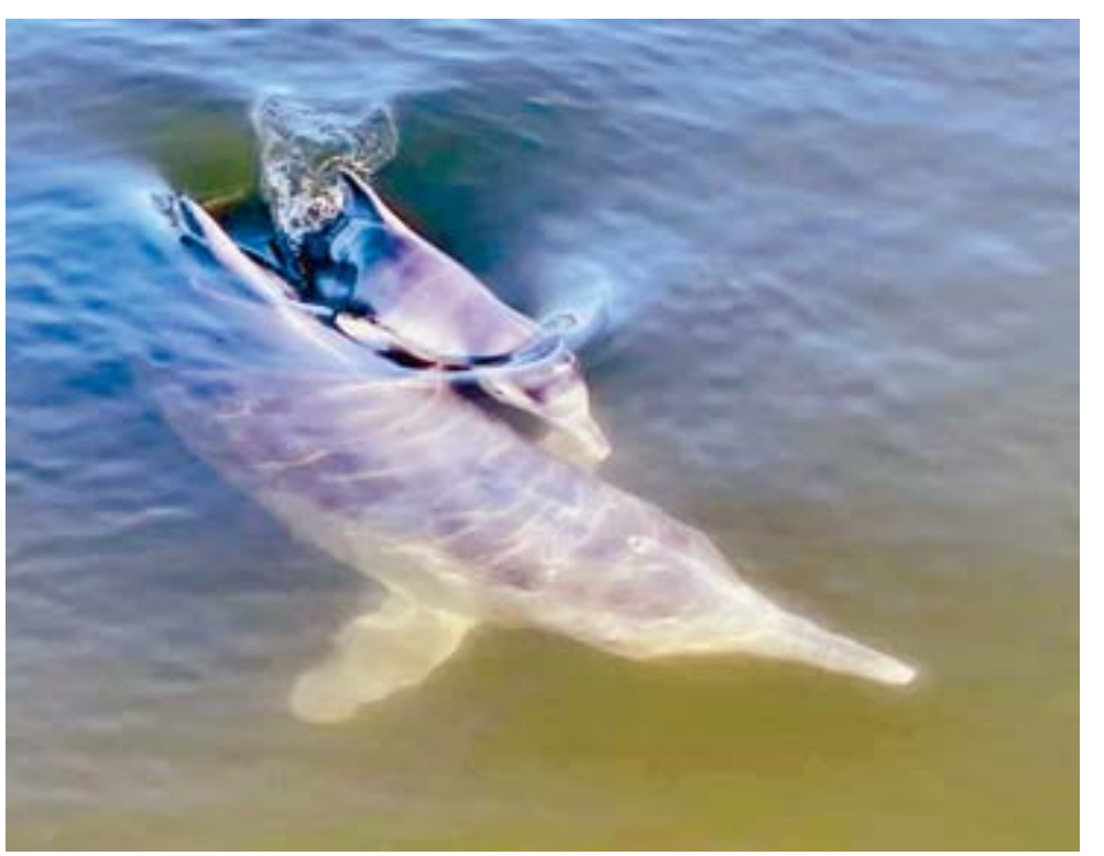
A new calf for mum Aussie at the Dolphin Centre, Tin Can Bay. Phone Barnacles Cafe & Dolphin

For more information visit www.barnaclesdolphins.com.au or Barnacles Cafe and Dolphin Feeding on Facebook.