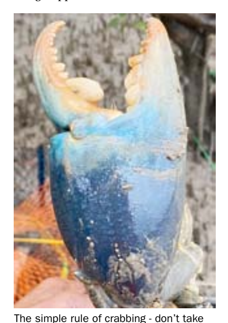
other peoples crabs or crab pots.

For information on Queensland's fishing regulations, visit www.fisheries. qld.gov.au, call 13 25 23 or download the free 'Qld Fishing' app from Apple and Google app stores.