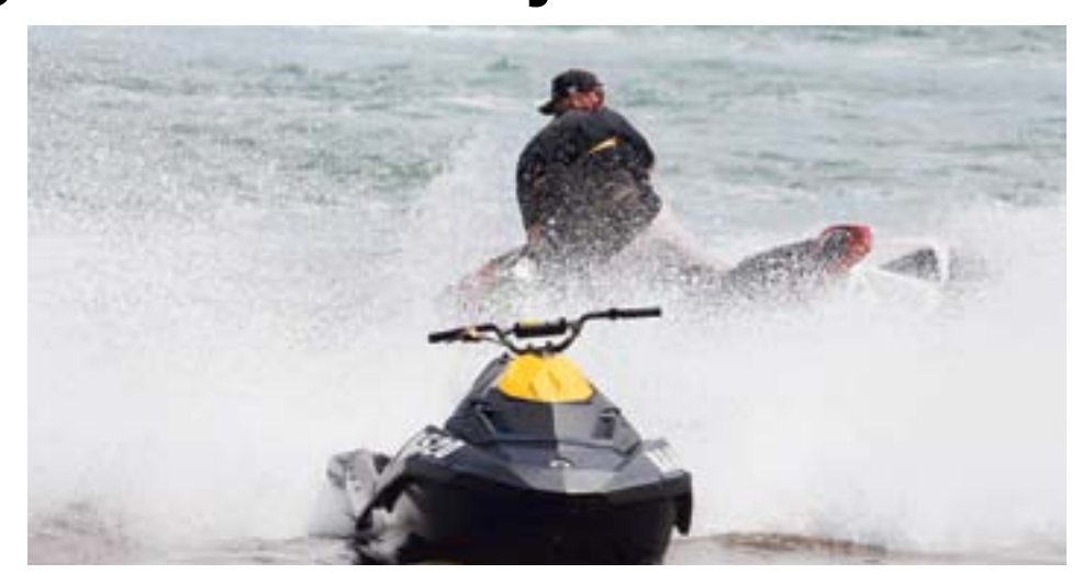
Photo of a speeding jet ski prior to the new 6-knot speed zone being established at Double Island Point on 4 February 2022

"We are confident responsible boaties understand why the speed limit was introduced and will support the move."