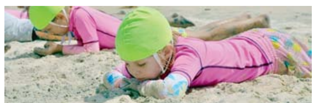
Green caps participating in flags.