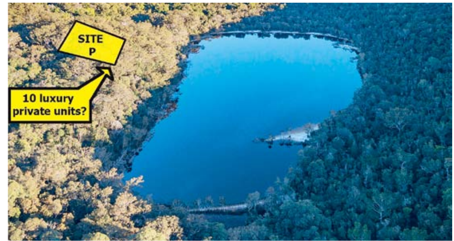
Aerial view of Poona Lake, with adjacent development sites marked.

"Poona Lake is set in a valley rather like a volcanic crater with steep sides covered with Great Sandy's amazing forests. It is accessible