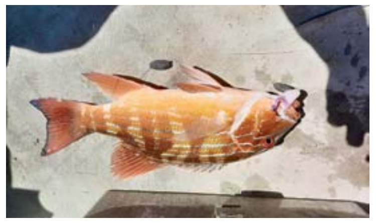
A very rare capture in The Bay, A Chinaman taken from Teebar Ledge.