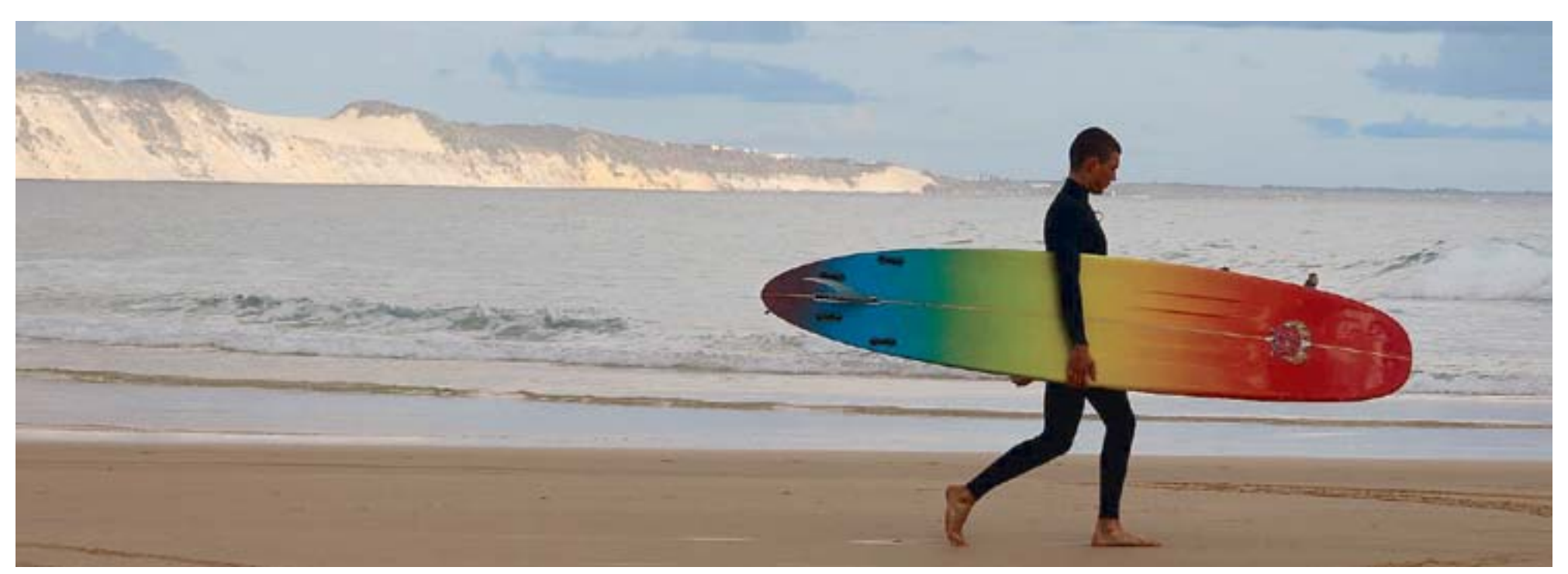
The beautiful view from Cooloola's environmental war zone.