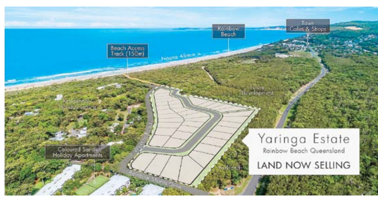
Fourteen Blocks have been released for sale at Yaringa Estate at the old golf course at Rainbow Shores.

Dee White from Cooloola Coast Realty said she thinks this is almost a 'coming of age' for