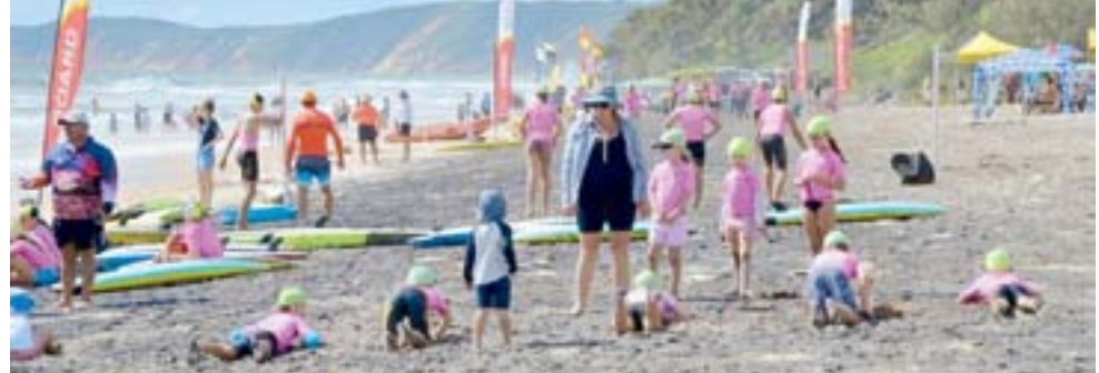
The beach is set up for Age Championship Day number two.