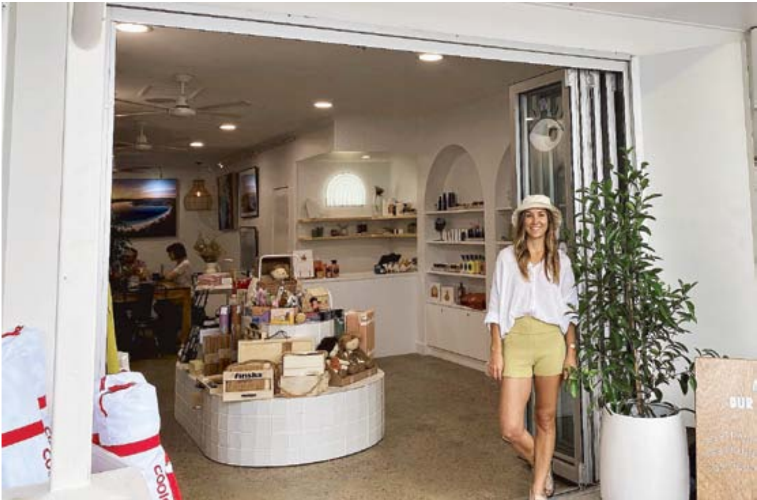
Welcome to new business Our Store, part of Little Parliament in Rainbow Beach

“It brings me so much joy to open the doors of Our Store as I truly believe in every brand we stock. Pargo provides clean drinking water to those in need. Raie eyewear provides a monthly donation to save Koalas and plants one tree with every sunglass purchase. Olli Ella is certified B Corporation which meets the highest standards of social and environmental impact. Brie Leon uses hand-made beads and natural pearls, their packaging is made of recycled paper and unbleached calico and their design focuses on everyday, classic and timeless pieces that can be treasured for years to come.”