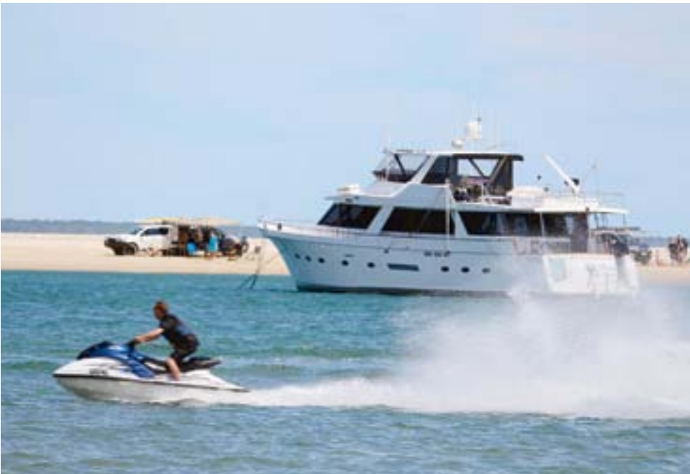
You only have a few weeks to submit your feedback on the proposed change to reduce the speed limit to six knots at Double Island Point

If you wish to submit your feedback, please email consultation@msq.qld.gov.au by 8 January 2022.