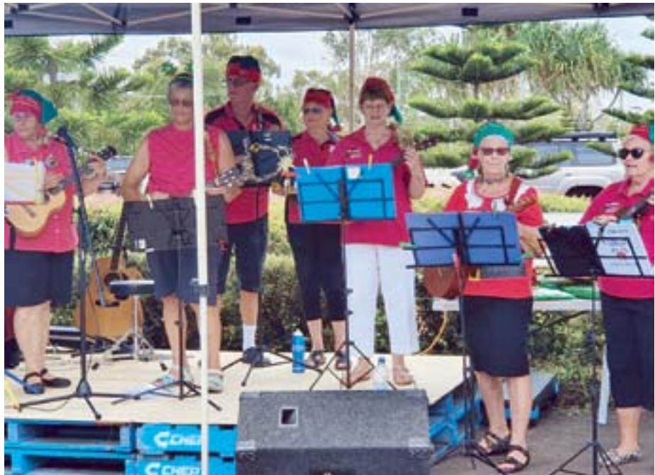
The ukulele club played at last years IGA Christmas party which is on again this year 17 December 8am to 12 noon

Come and say hello and enjoy our new deck!