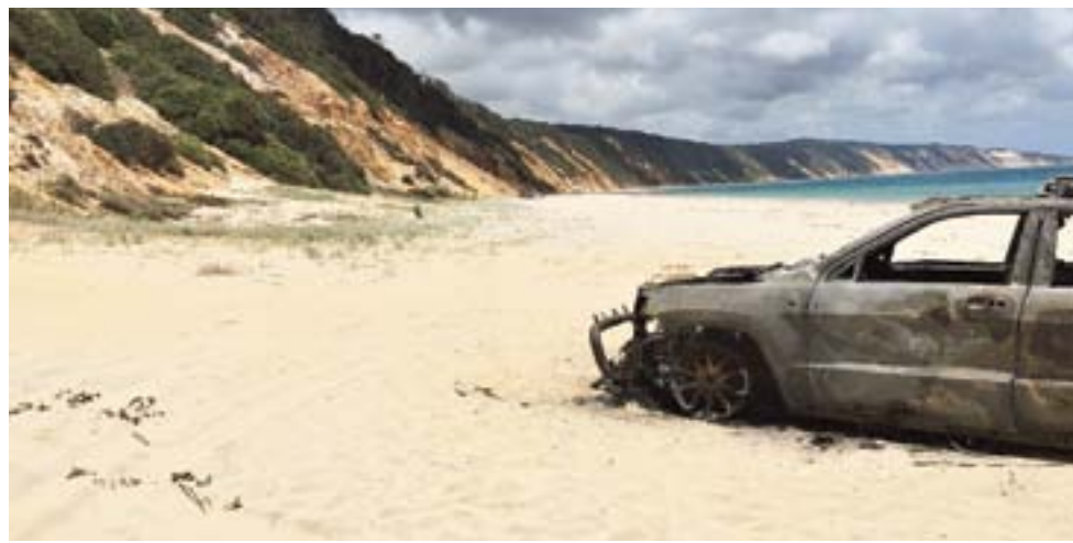
Not the way you want to spend your weekend. The burnt shell of a car near middle rock last week captured by The Ice Man, Rob Gough.