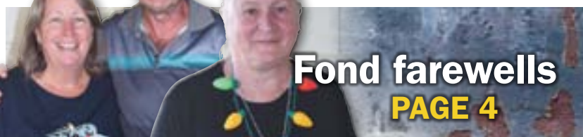
Fond farewells PAGE 4

Phone: 5321 3050 Trades and Classifieds: 1300 666 808