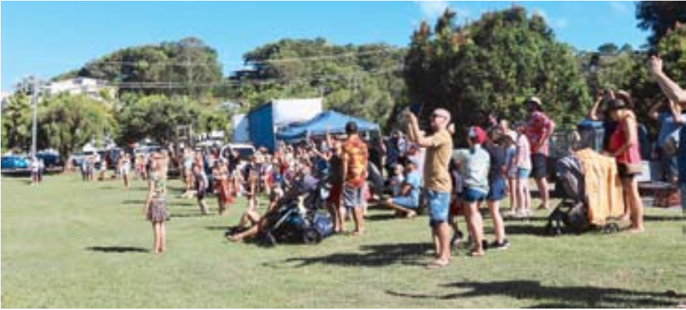
A huge crowd came to the Rainbow Beach Community Christmas Party last weekend.