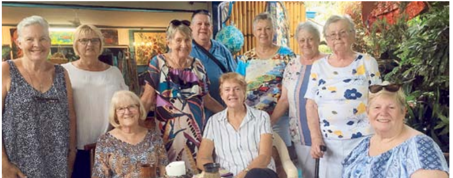
The Tin Can Bay Fishing Club members enjoyed a morning tea at the Bay Art Gallery.