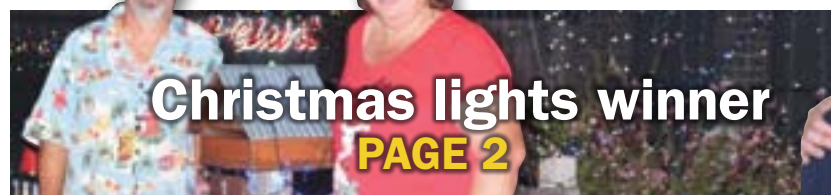
Christmas lights winner PAGE 2