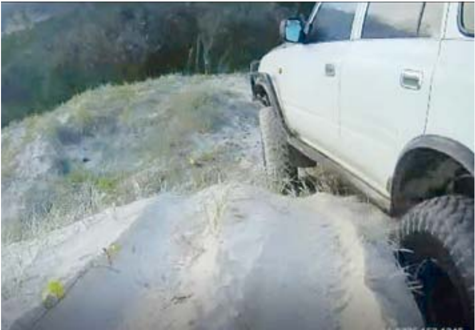
Don't be a tool. Respect the beach and the people who also come to enjoy the Gympie region

“A number of drivers were observed to be not wearing a seatbelt when beach driving, and are now dealing with a fine of $275 each.” He said people have been thrown from vehicles and suffered serious injuries or been killed during rollovers and other accidents on the beach.