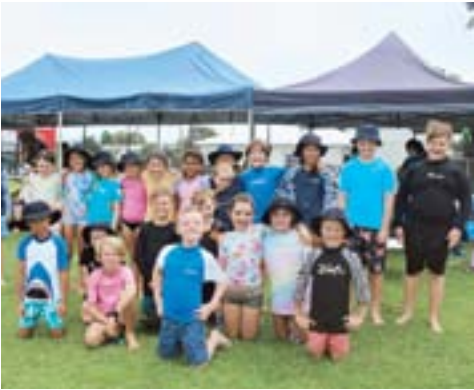
The best fun about the end of the school year is the swimming carnival and these students from year 2/3 class are looking forward to cooling off.