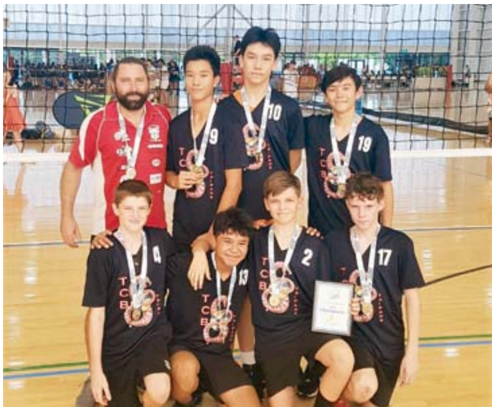
Congratulations to the Tin Can Bay School men's grade nine team who have been crowned the gold winner of the men's division 2 Australian Volleyball Schools Cup for 2021!

youth of our region are better because of you."