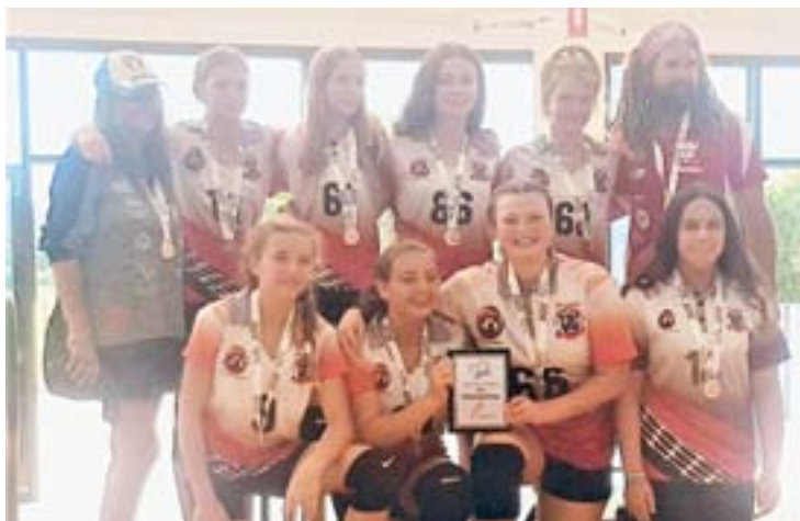
And the women's winners of the Australian Volleyball Schools Cup division 2 for 2021 are .....Tin Can Bay! Congratulations.