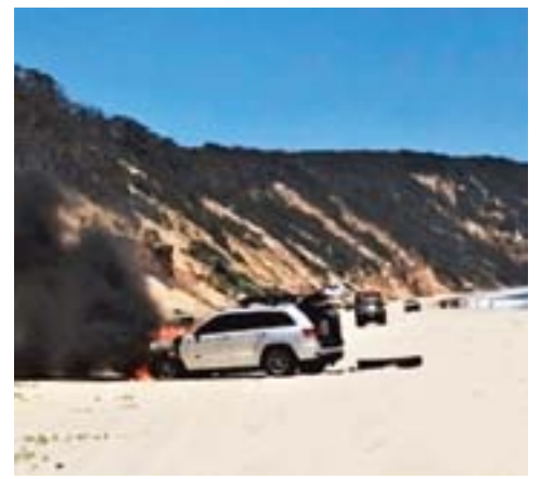
This car burnt to a crisp between Rainbow Beach and Double Island Point last week.